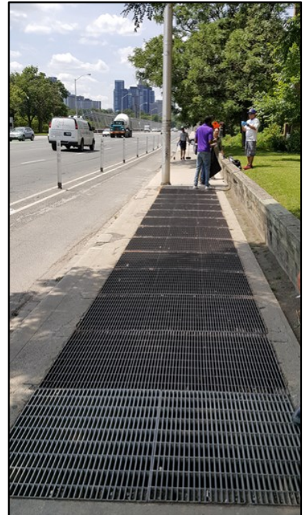
Ventilation shaft located on the north side of Danforth Avenue, just west of Broadview Avenue

To help expedite the completion, work will be scheduled from 7:30 a.m. to 7 p.m. on weekdays. Occasionally, the TTC crew may need to work on Saturdays.